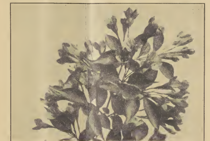
RECOMMEND FOR THE MIDDLE ROW OF FOUNDATIONS

12 to 15 in. .... $10 $90 15 to 18 in. .... 15 135